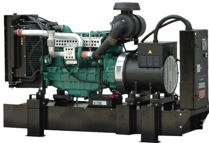
The presented image is for illustration purpose only.