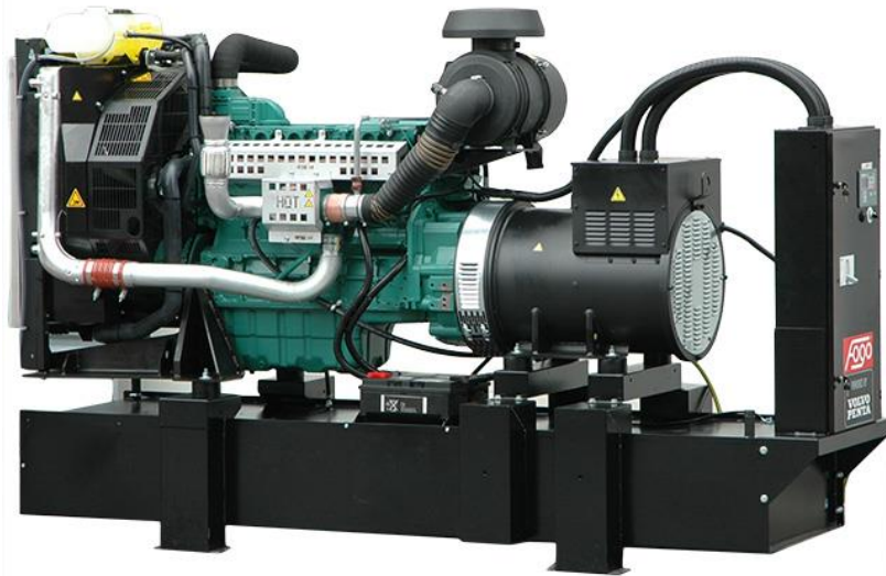
The presented image is for illustration purpose only.