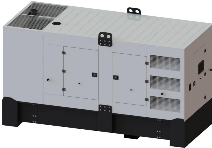
The presented image is for illustration purpose only.