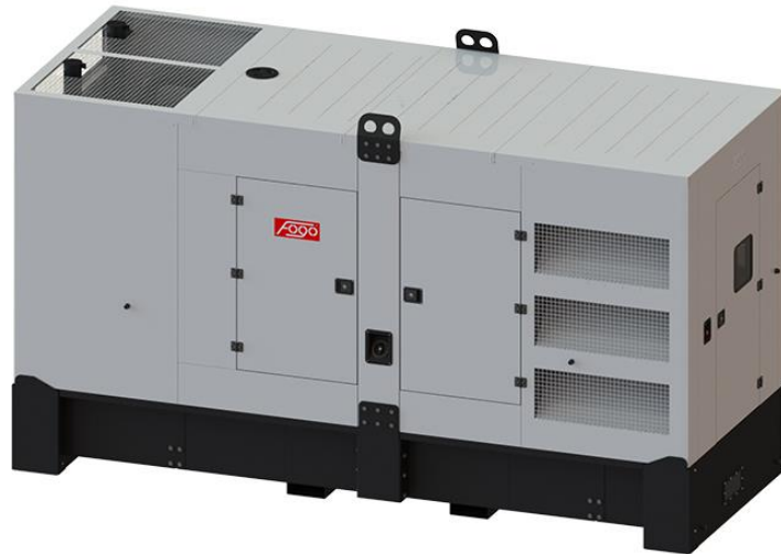
The presented image is for illustration purpose only.