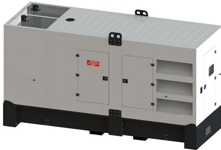
The presented image is for illustration purpose only.