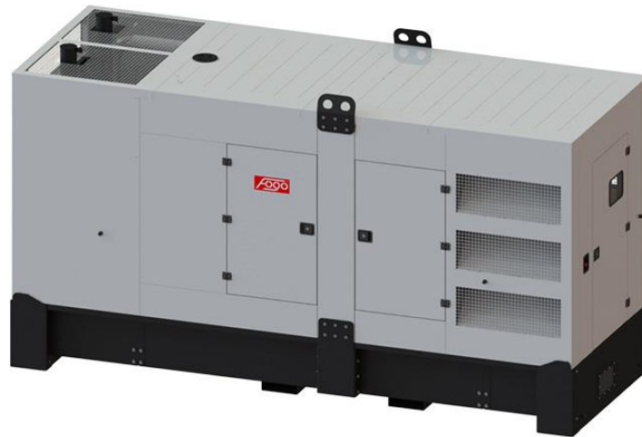
The presented image is for illustration purpose only.